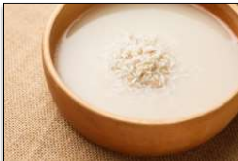
Figure 3: Rice water