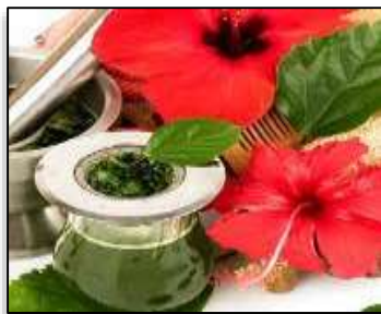
Figure 4: Hibiscus (33)