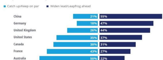
FIGURE 5 AI early adopters in some countries are more likely to use AI to create a strong competitive advantage

Note: Not shown—respondents who take the more neutral stance that they're "edging slightly ahead."